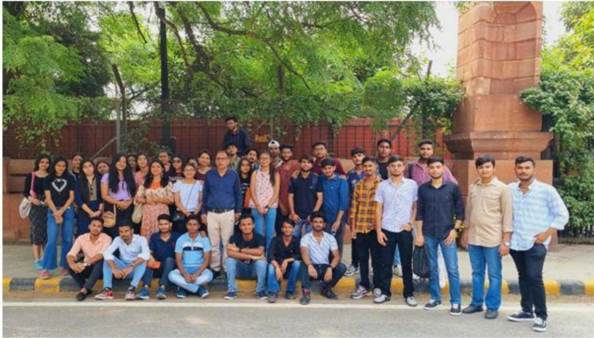
Students and staff member of political science department